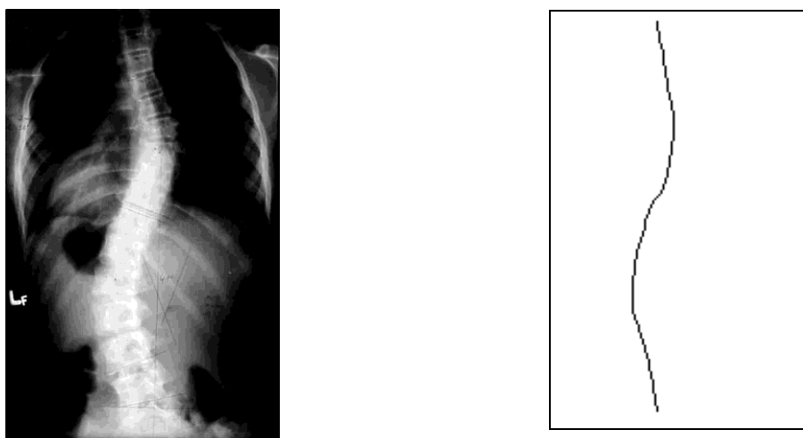
Pict.1 Marking of the vertebral column centre using neural network