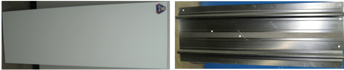
Figure 1. Photos of a composite panel's front and back side. The panel is 152cm long and 54cm wide.